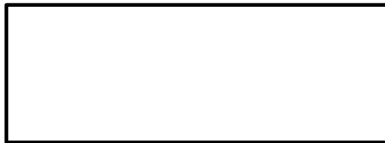
Figure 1: Name of Picture

Source: Author's Last name OR Organization's name (Year, Page number OR Online) Khoman (2017, p. 137)